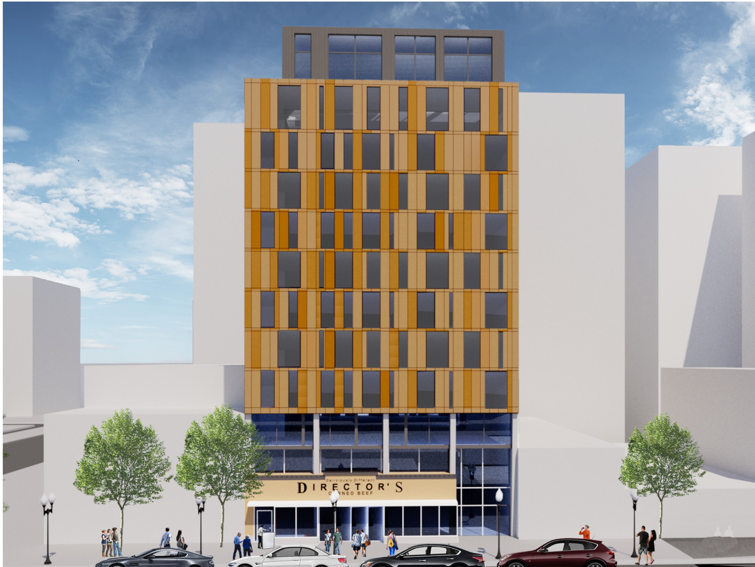
VIEW FROM 5TH STREET (60' HEIGHT)